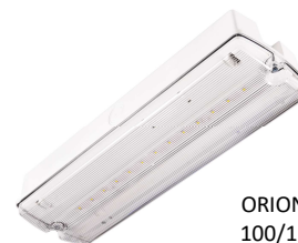
ORION LED II 100/150/250

Installation and maintenance instructions