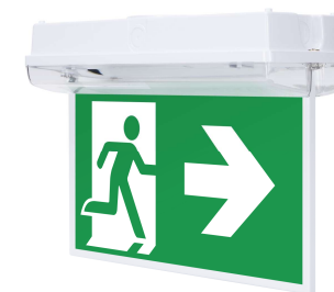
ORION LED II DS

Versions: Orion LED II 100 / Orion LED II 150 / Orion LED II 250 / Orion LED II DS